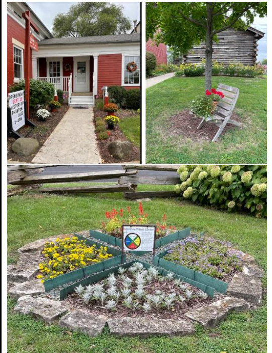
Clockwise: Lobby entrance. View from rear parking lot. Medicine Garden behind the Trading Post

The Master Gardener volunteers devoted long hours and elbow grease to keep the park-like grounds around the museum beautiful, making the museum attractive to more than just our wonderful human guests all season long. A large overgrown area was cleared out by the rear porch. Behind the Trading Post, the Medicine Wheel warms the eyes and soul. A collection of hostas teems with green textures. Colorful bursts of flowers appear around each corner. The border garden draws attention to the Sewall Andrew's original stone wall possibly used for containing his Merino sheep – which many other early settlers in the area also kept. Time for a winter rest. ■